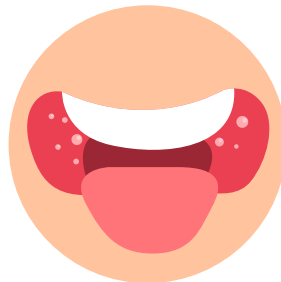
TINY WHITE SPOTS IN MOUTH