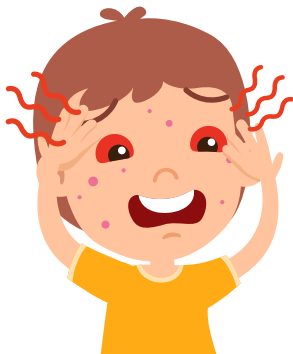
RED, WATERY EYES