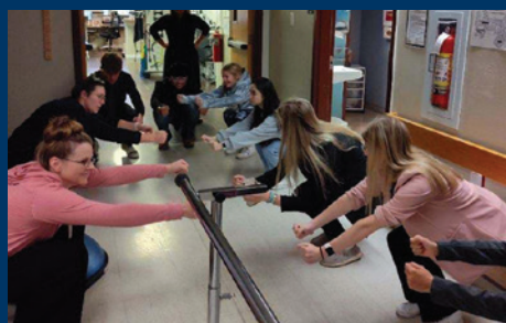
Logan Health – Shelby physical therapy department teaches Shelby High School med prep students more about the profession of being a physical therapist.