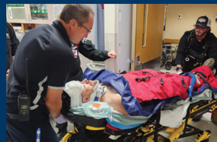
Logan Health – Conrad and Logan Health – Shelby participate in a full-scale mass casualty exercise with local first responders, Logan Health A.L.E.R.T and Benefis Hospital's Mercy Flight.