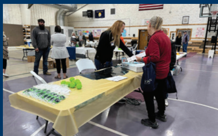
Logan Health – Cut Bank hosts a community health fair.