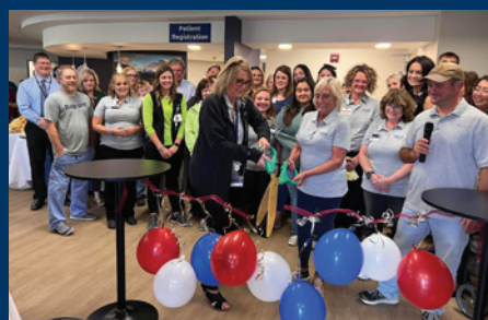
Shelby Area Chamber of Commerce and Logan Health – Shelby leaders and staff cut the ribbon to officially open the doors of the new primary care clinic.