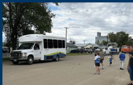
Logan Health Assisted Living - Chester residents and bus participate in the Chester-Joplin-Inverness school homecoming parade.