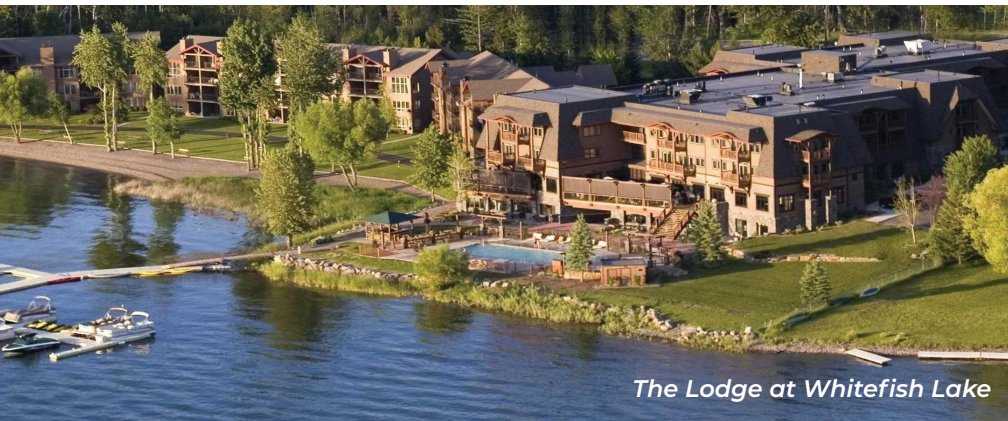
The Lodge at Whitefish Lake

No refunds after September 11, 2024. All refunds granted prior to September 11, 2024 will have a non-refundable service charge.